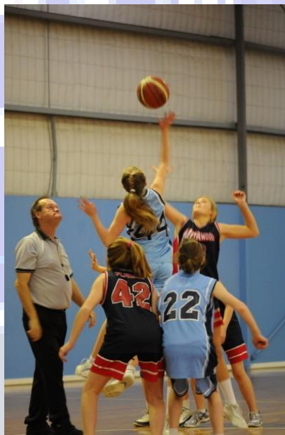
Under 14 Girls – Division 3 Sturt Sabres – Mildura 2010